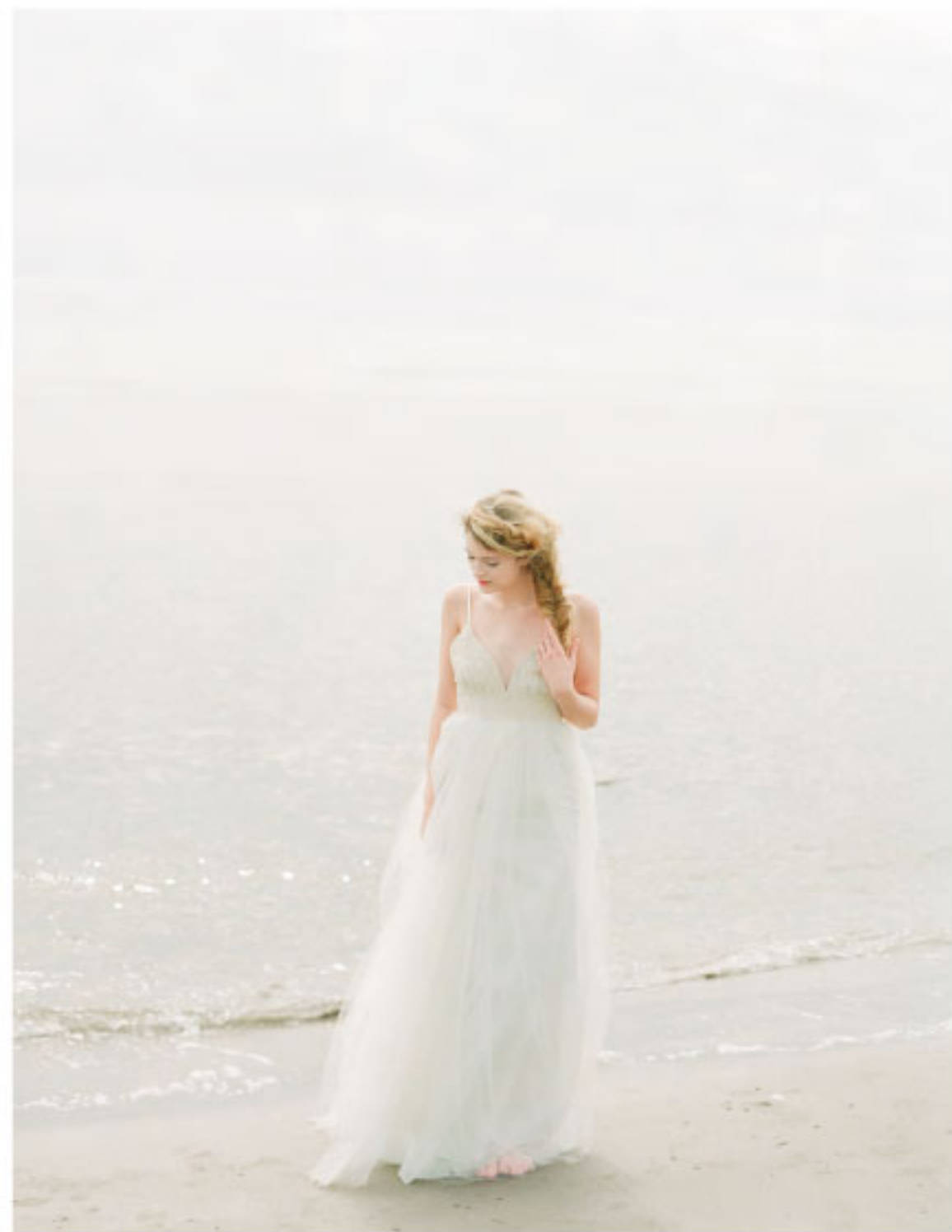
[THIS PAGE] Elizabeth Dye pale mint Lewisia gown with lace bodice and weightless tulle skirt; [OPPOSITE] Ralph Lauren Collection ostrich feather cape